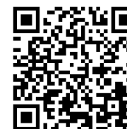
Mitaka Family Support Center

If you have any questions, please feel free to contact us.