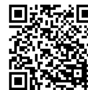
Babysitter Assistance Program (Temporary Childcare Support)