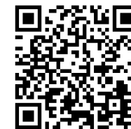
Mitaka Family Support Center

If you have any questions, please feel free to contact us.