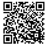
Babysitter Assistance Program (Temporary Childcare Support)